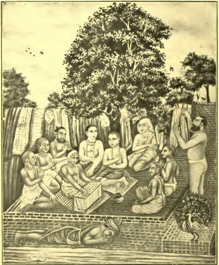
KING PRATAP RUDRA BOWING TO CHAITANYA

(From an old painting in the possession of the Zamindar of Kunjaghata).